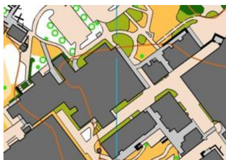
Sprint Series Feb-April